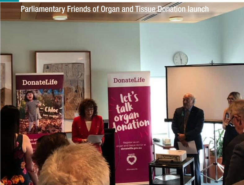
Parliamentary Friends of Organ and Tissue Donation launch