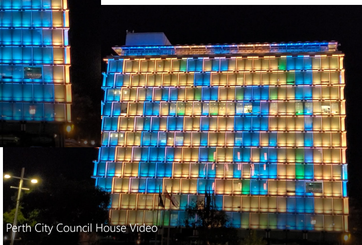
Perth City Council House Video

City of Perth Council House lit up to raise awareness of upcoming Donor Heroes Night. Pictures don't do it justice; please view the video on our website!