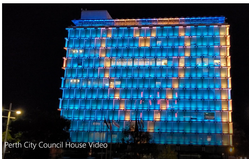
Perth City Council House Video

And finally, DonateLife, Transplant Australia, Kidney Australia and other organisations are having greater involvement in displaying the event on their social services.